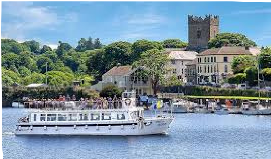
Boat trips on the River Shannon