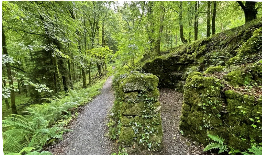
Walking and hiking trails throughout the area