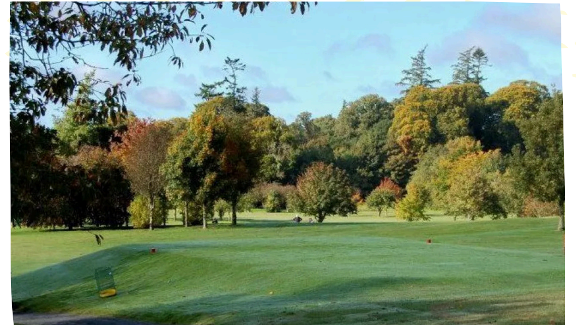
Golf at nearby championship courses