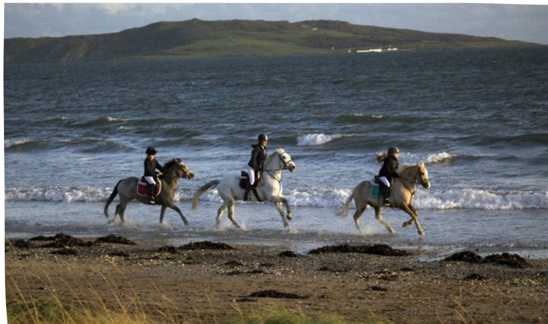
Horse riding through the countryside