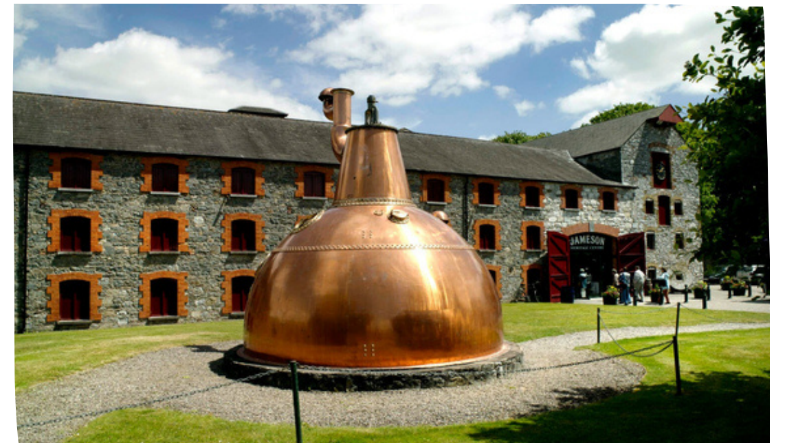
Whiskey tasting at local distilleries