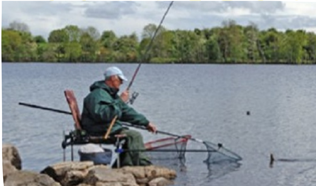
Fishing on Lough Derravaragh and local rivers